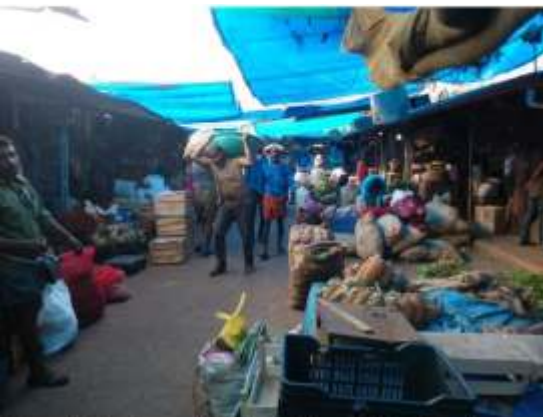
Figure 2: Photograph of Ernakulam Market stalls

These recommendations find their resonance in the Kochi Smart City Proposal (2016) towards a 'holistic replicable retrofit transformation of 7 sq km of Fort Kochi-Mattancherry-Central City linked by waterway'. Its key components include increased densities, reconstitution of land parcels and urban form, mixed use, transit oriented development, redevelopment of market and retail areas, etc. Foreseeing risks associated with limited availability of developable land, it advocates an inventory of developable land, land-pooling measures and effective citizen engagement to instill a sense of ownership and openness to reconstitution.