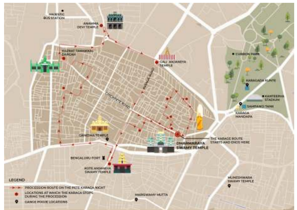
An illustrative map of the Pete area indicating the gange pooje locations, karaga procession route and the locations where the karaga stops on the Pete Karaga night.

Kunte (salt water pond) associated with the birth of the Goddess is visited on the second, seventh and ninth days. The Sampangi tank (Shakti Peeta – powerful location) at Sampangiram Nagara, Muneshwara Swamy temple (previously a Hoovina Totha – flower garden) at Sudhama Nagara, Jalakanteshwara temple at Gavipuram (part of Kempambudhi lake), Ganesh temple at KR market (part of Siddi Kate (a lake named after Siddi)), Anamma Devi temple at Majestic (part of Dharmambudhi lake) and Mariswamy Mutta (monastery) at Kalasipalya are other notable locations visited during the festival.