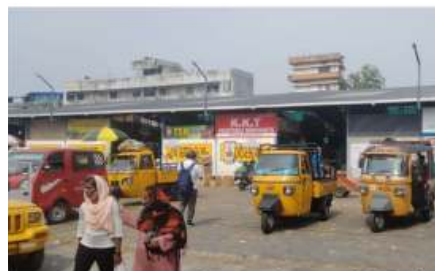
Figure 7: Temporary market site after completion of works

Keeping pace with trends of rapid urbanization in cities requires measures such as densification, mixed use and urban land management strategies to safeguard against environmental