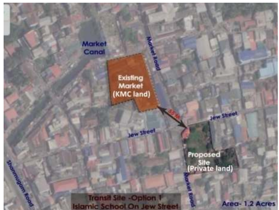
Figure 1: Location of existing market and proposed temporary market sites