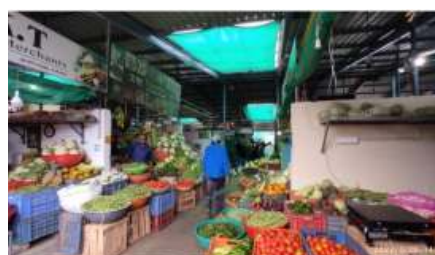
Figure 8: Temporary market after relocation of stall owners

degradation and ensure access to services. Dynamics of public sector requirements, complexities of urban development, challenges of land availability are best addressed through professionally conducted technical audits, awareness of urban issues, stakeholder engagement and co-operation, and the leadership of community representatives. These then ensure successful delivery of public sector projects and help to revitalize Kerala's cities and unfold their creative potential.