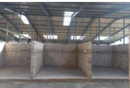
Figure 6: Temporary market during construction

commencement of works of the temporary market.