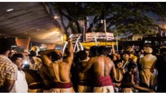
Seen in the image are a group of veerakumaras on one of the gange pooje day's taking rest in between the events.

Poojari (priest from the Potharaja household), Veerakumaras (herosons of Draupadi – who protect the Karaga priest during the procession), Bankadasi (the ones who play instruments), Kolkar (bearer of the news of ritual events) and Chaakridaaras (festival workers).