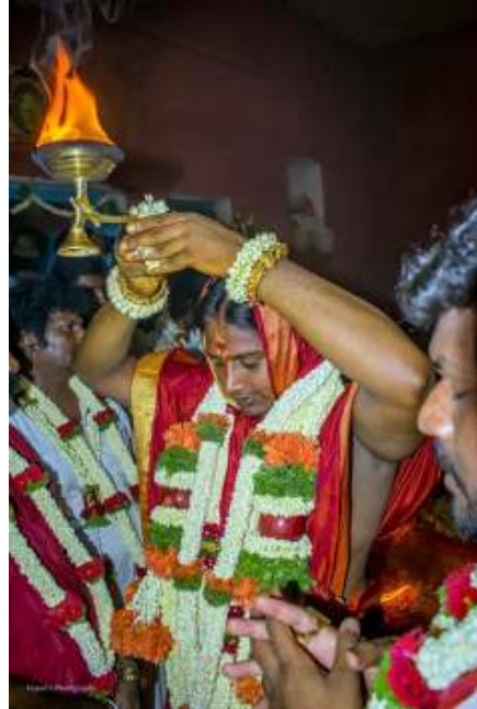
The karaga priest performing gange pooje at one of the locations.

Purnima (full moon day – fifteenth day of the month) are the most significant rituals of the festival. During the night procession, apart from visiting temples within the Pete area and houses of priests, the Karaga stops at the Hazrat Tawakkal Mastan Dargah in Cottonpet as a part of an ancient legend. The common story about the relationship between the goddess temple and the dargah is that, one year the Sufi saint was hurt during the procession and he cursed the Karaga such that it could not go ahead until turmeric powder/paste from the temple was applied to his wound to pacify him and hence the karaga visits the dargah to commemorate this event. This is another special element of the Karaga, which represents the secular nature of the festival.