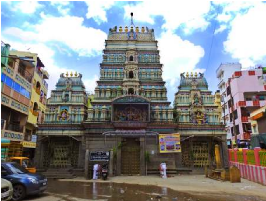
The Dharmaraya Swamy temple in Tigalarapete is the primary locus of the festival. It is the main temple of the Vahnikula Kshatriya community and is one of the major temples dedicated to the Pandavas and Draupadi in the city.

Special rituals and traditions are performed on each of the eleven days in a specific order. These customs are performed by different members of the Vahnikula Kshatriyas, namely, Kula Gowda (community headman), Ganachaari (community chieftain and spiritual instructor of the Karaga priest), Gante Poojari (bell priest), Karaga Poojari (priest who carries the Karaga on his head), Kula Purohita (community priest), Potharaja