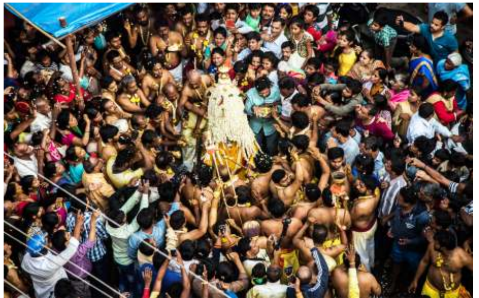
Devotees seeking blessings from the Karaga while the priest is on a procession.

most significant festivals – the Bengaluru Karaga. Festivals are an intrinsic part of the cultural landscape of any place. They have a profound cultural relationship with the city in which they are celebrated, the geographical setting and the people of the city. Bengaluru has been a multi-cultural space since its origin and the city is home to several ritual centres and festivals which emerged from its different communities and their histories. The Karaga Sakthi Utsava (festival) is one of the oldest annual civic festivals celebrated in the historic Pete (old town) and its surrounding areas by the Vahnikula Kshatriyas (warrior clan), a subgroup of the Tigala (a backward class) community. The Tigalas are a group of migrants consisting of