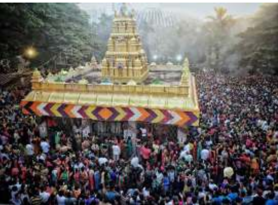
The Aarati Deepotsava (festival of lights), a special ritual, where women and girls of the Tigala community play the primary role, celebrated on Dvadashi (twelfth day of the month) and Pongal Seve (sweet rice offering) on Chaturdashi (fourteenth day of the month) are other important traditions of the festivities.