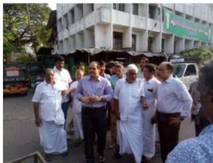
Figure 3: MD (CSML, KMRL) meeting with Ernakulam Market Stall Owners Association representatives at site

KSC 2016's proposed Redevelopment of Ernakulam Market (Economy & Employment module) was undertaken by Cochin