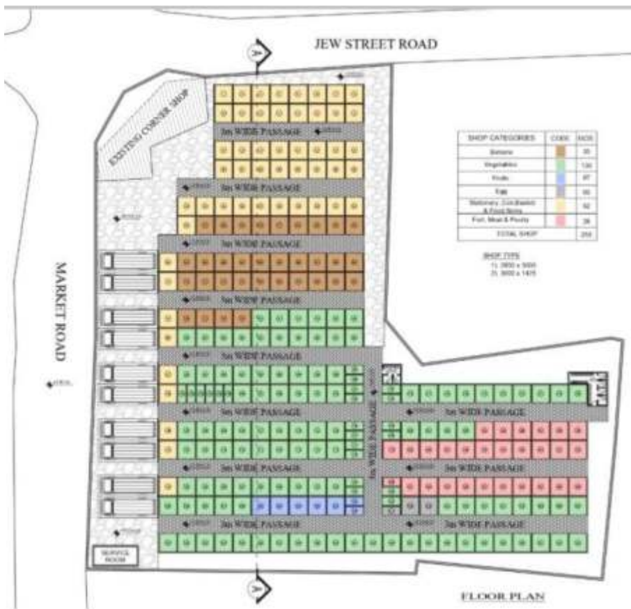
Figure 5: Proposed layout of temporary market at vacant school site

However, the identified private site was caught up in a legal tangle due to a dispute among its landowners. The Kochi Corporation authorities moved the Kerala High Court where a petition regarding partition of the land among the owners had been pending. The High Court allowed the Corporation and CSML to use the land for two years for arranging a temporary set up for rehabilitating the stall owners, after which they would be allocated stalls in the renovated market and the land given back to the owners. But one of the landowners moved the Supreme Court against the High Court order. The Supreme Court's verdict (Nov 2020) dismissed the petition and paved the way for