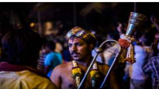
Seen in this image, is a bankadasi (wind instrument performer) who is an integral member of the core group involved in all the rituals and traditions of the festival.