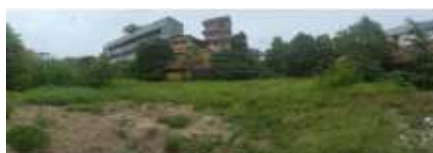
Figure 4: Photograph of vacant school site proposed for temporary market

Smart Mission Limited. Following stakeholder consultations with Kochi Municipal Corporation (land owner) and Ernakulam Market Stall Owner's Association, the DPR (PMC, 2019) proposed densification of the 1.6 acre market site (basement, ground plus three floors) – a site in close proximity to public transit corridors. An audit of available developable land, for rehabilitation of 213 (plus) stall owners, identified an unused 1.25 acre former school site located just 60m away on Market Road. Weighing the project's public purpose, livelihood of stall owners against the non-functional privately owned land, the District Collector instructed CSML to enter into an agreement with the landowner for temporary usage of the land till the completion of the new market building.