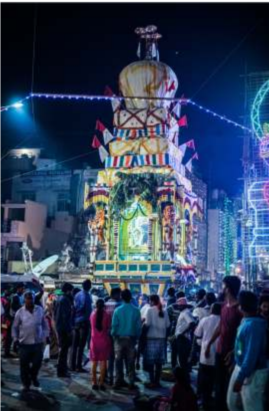
The chariot procession of Draupadi and Arjuna after their marriage on the night of the Karaga procession.

Karaga Purana or Vahni Purana (an oral epic associated with Karaga performance) is recited on Padyami (the day after full moon day) at the Ellusutina Kote (seven-circled fort) temple within the campus of the city corporation building. After the Karaga procession, Arjuna (one of the Pandavas) and Draupadi are married and are taken on a Rathotsava (chariot procession) through the streets of the Pete area. On the last day (Bidige – seventeenth day of the month), the men of the community participate in Vasanthotsava (playing with turmeric water) and the festivities comes to an end by Dwajavarohana (lowering the flag).