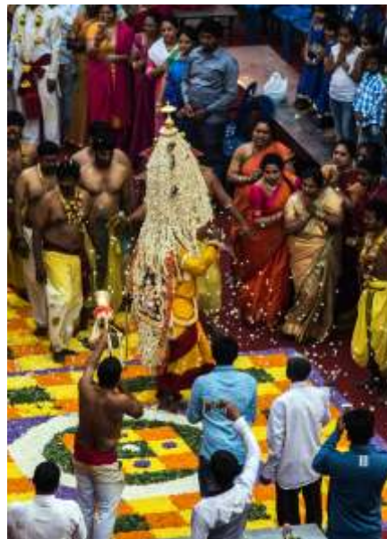
In this image, the karaga priest, dressed in turmeric yellow sari with red border, black bangles, gold waistband and pearl and ruby chains performing at one of the locations and offering blessings to the devotees.

The term Karaga refers to a water pot carried in the left hand of the priest on the day of its 'birth'. It is also described as a sacred pot symbolizing the primal Goddess's power and to the priest when he is carrying the pot.